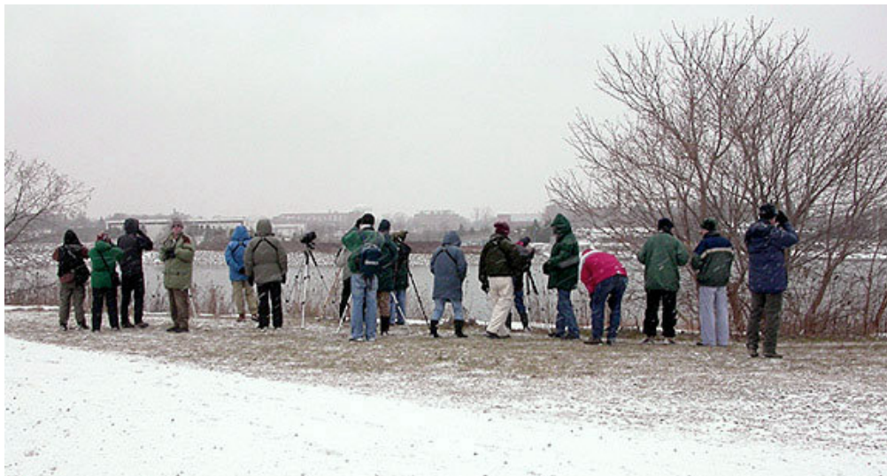
OFO group Winter Birding at Colonel Samuel Smith Park, Toronto, 9 December 2007.

Names in ITALICS indicate subspecies, hybrids, morphs or other 'recognizable forms', which may be identifiable in the field. This does not necessarily imply that the compilers agree with such designations, or accept their validity.