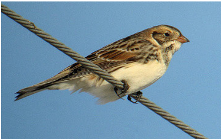
Good showing of Lapland Longspur at Beare Road and Steeles, Toronto, 8 December 2007.

LAPLAND LONGSPUR - 9 at Beare Rd S of Steeles on 9 th (ETB) & 1 at SE Tip, LSS on 26 th (NMu,MVL). CW for Toronto CBC [Sector 16A].