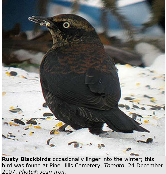
Rusty Blackbirds occasionally linger into the winter; this bird was found at Pine Hills Cemetery, Toronto, 24 December 2007.

RUSTY BLACKBIRD - 7 at Beare Rd S of Steeles on 8 th , 12 on 9 th & on 12 th (ETB). 2 at Park Lawn Cemetery (TXC,GC) & 1 at Pine Hills Cemetery (TXC, KK, Ken McIlwrick) on 23 rd . The Pine Hills Cemetery bird was seen again on 24 th (RLau), 25 th (David Selley fide ONTBIRDS; RBHS, WP), and on 27 th (FP fide ONTBIRDS).