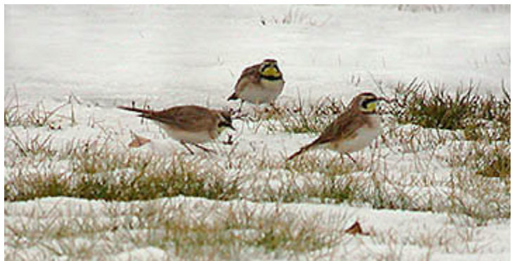
Three of nine Horned Larks at Beechwood Cemetery, York , on the Toronto CBC, 23 December 2007.

HORNED LARK - some at North Rd N of Hwy 7, Durham on 4 th (ETB), 20 at Warden & 19th Ave, York on 15 th (GDe,RHXC), 6 at Conc 3, Sideline 34 Pickering, Durham on 20 th (ETB,JI, fide ONTBIRDS) & 30 at Halls Rd., Durham on 21 st (SLaF fide DRBA). 2 at LSS on 23 rd [Documented] (TXC, JRC, &) & 9 at Beechwood Cemetery, York on 23 rd [Documented] (RBHS,WP,TXC); rarely recorded on the CBC due to lack of habitat within the circle. 1 at SE Tip, LSS on 26 th (NMu,MVL).