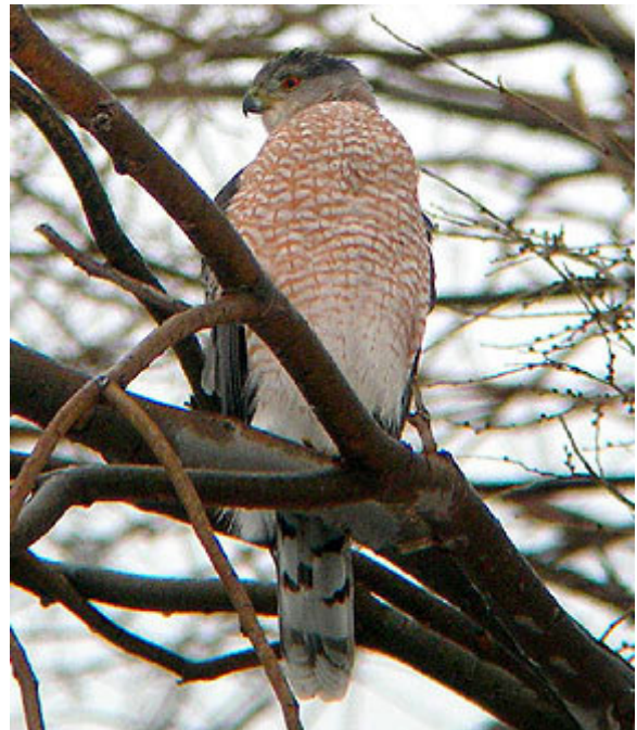
An adult female Cooper's Hawk with a full crop, having just raided a feeder and consumed her prey; Toronto , 2 December 2007.

ROUGH-LEGGED HAWK - 1 at Oshawa Second Marsh, Durham on 1 st (THo fide ONTBIRDS) & 34 (including 5 dark morph) at Cranberry Marsh, Durham on 1 st (CMRW fide JDL, fide ONTBIRDS). 1 at Valley Inn, Halton on 7 th (anon fide CEdge, fide ONTBIRDS), 1 (dark) at LSS on 8 th (Andrew Don;IDMF fide ONTBIRDS) & 1 at TI on 13 th (NMu,MVL, fide ONTBIRDS).